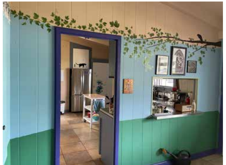
Opposite wall where the second crow is.