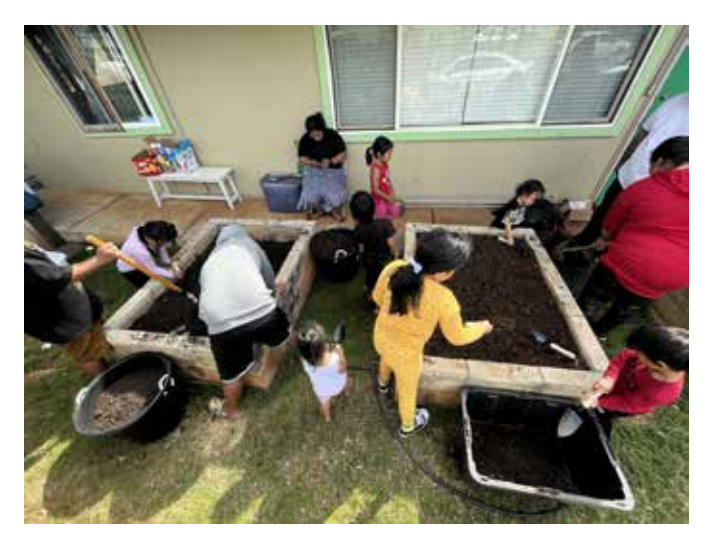
The Tuesday garden project is going gangbusters!!!! The yutes who are so used to concrete are learning how to prepare soil (NOT dirt!) and learn about the miracle of seeds. You go gang!!!!