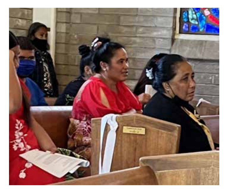
The Chuukese choir was in fine form with melodious melodies in 4 part harmony!!!!!