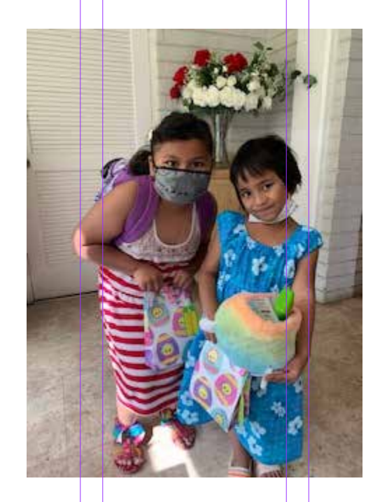
Keiki with Easter Baskets