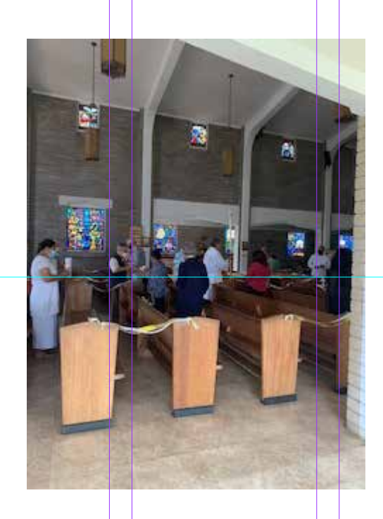
Procession of the Pascal Candle!!! St. Elizabeth's `Ohana