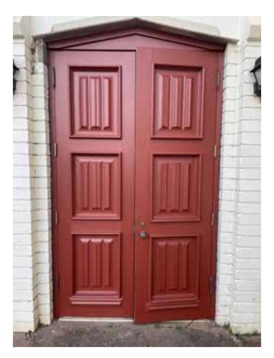
Here's the finished product that Dave Kleinschmidt so wonderfully completed last week. The chapel doors are now in tiptop shape once again! Thanks Dave!

The wonderfully melodious bell choir was back in action this past Sunday! What a joy to see our old friends back doing what they do best! Making music to the glory of God!