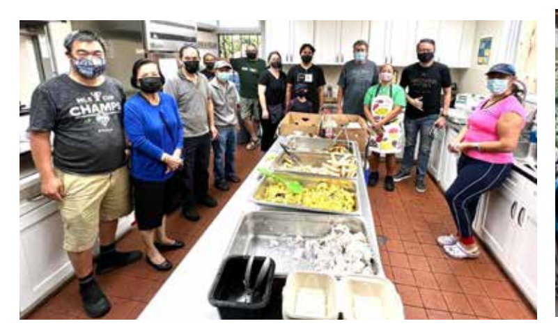
Da Breakfast Gang is looking mighty fine!