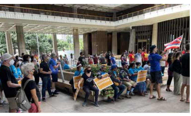
A gaggle of us were at the Capitol for livable wage issues and protecting Mauna Kea! Imua!!