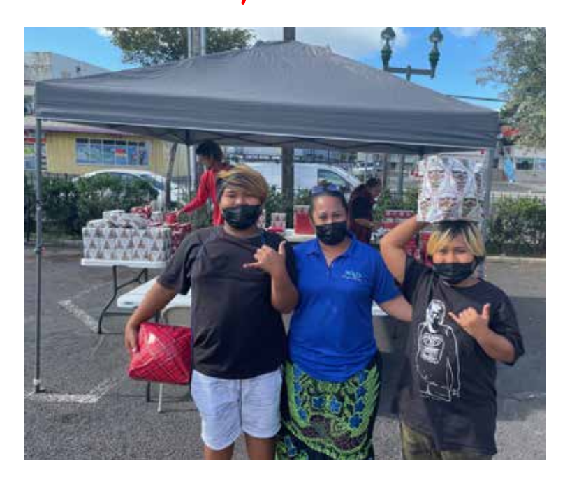
A family enjoys gifts for their kiddies.

What a jam packed Saturday 'twas December 18! From early morning breakfast prep to COVID shots all day to a scaled down but still 100 gift giveaway Christmas party, de place was rockin and rollin!! And Santa Ofa kept an eye on all of it! Merry Christmas!!!!!!