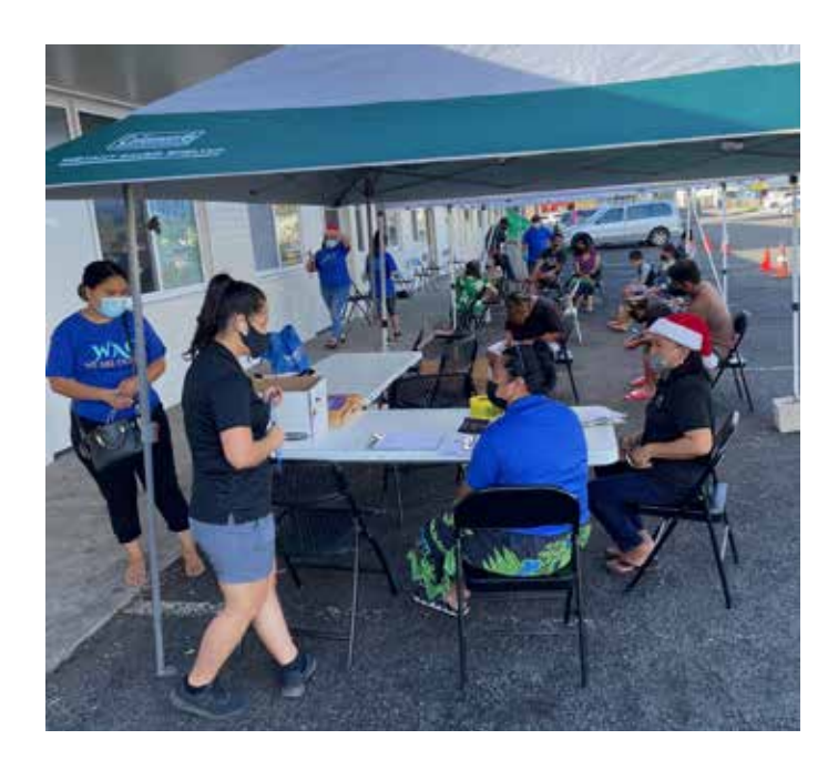
COVID shots anyone???