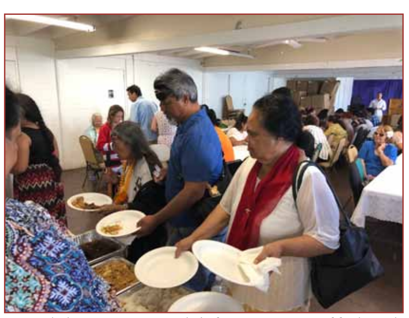
And the Easter Brunch left everyone stuffed to the ears with fine delicacies from all corners of the earth!!!