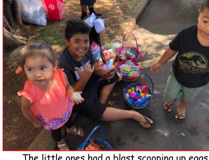
The little ones had a blast scooping up eggs that chickens of all kinds of colors laid and left all over the yard!

Mo and Mel, the super duo, oversaw this year's fantastically successful Easter Camp!!! The youngsters had a blast with food and games and bible study and even a morning in the art studio!!!! Thanks to all the grown ups who helped our kids have such a great time!!!!