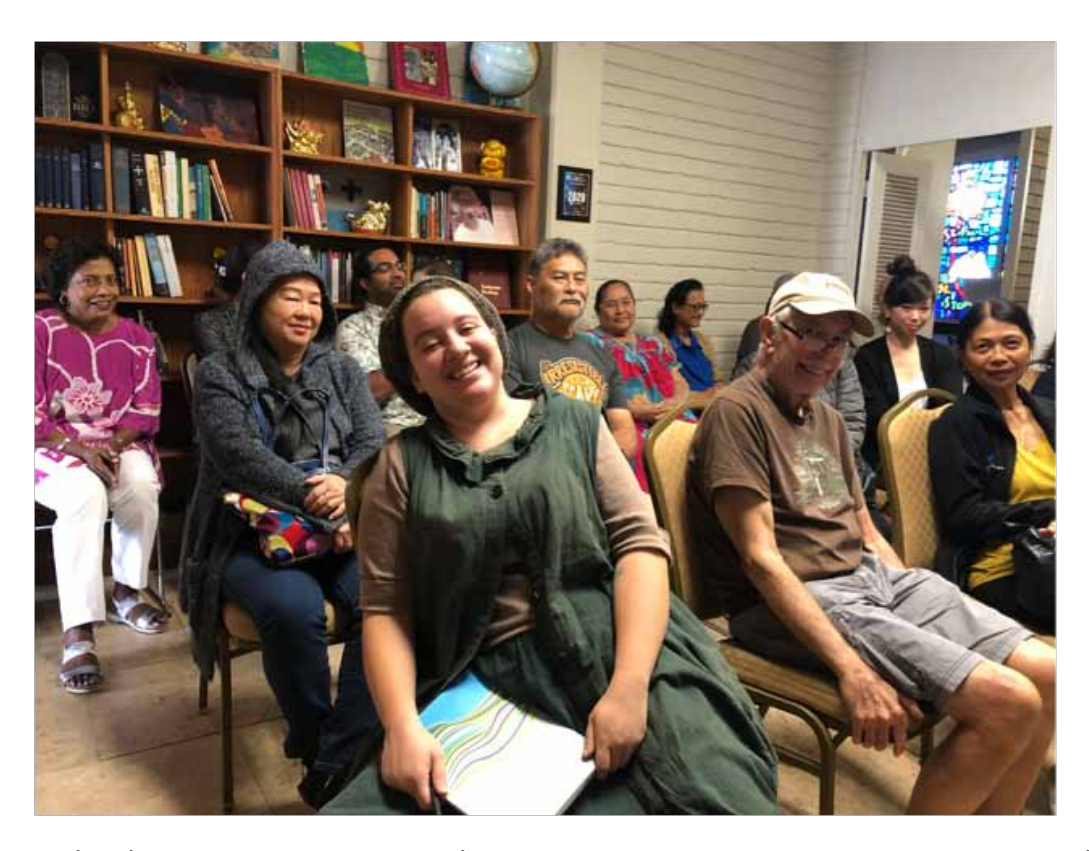
The happy campers at the Lenten Series: Learning Our Faith Again... for the first time... So sorry it turned into classes interruptus due to the pandemic....We miss you all!!!!!!