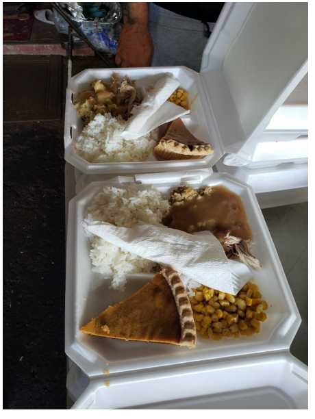
Hau'oli Lā Ho'omaika'i Happy Thanksgiving

Even though we had to cancel the church based Thanksgiving meal prep due to the virus, the Langi family gathered at their home, masked up and socially distanced — and ended up filling 150 hungry stomachs of our unsheltered neighbors and friends!!!!!!! With special thanks to the youth who really stepped up with this effort. God willing, next year we shall all be part of this wonderful ministry once again!!!!!!!!!!!