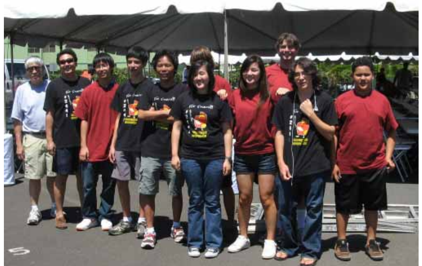
The Scouts came to help with the set up and preparations.