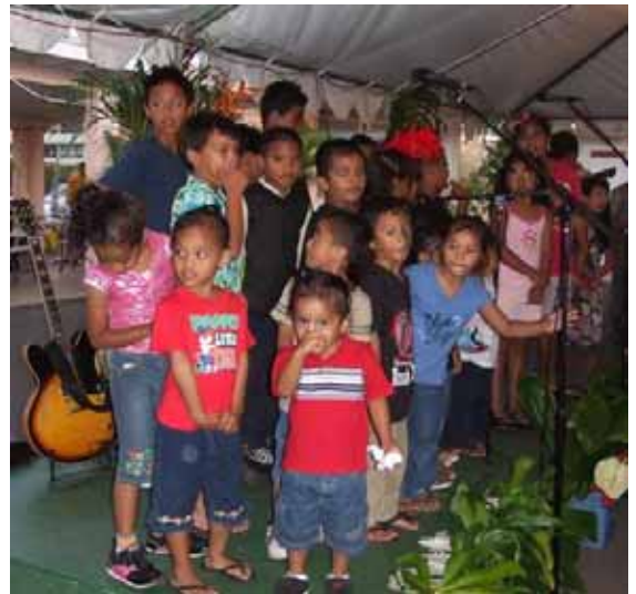
St. Elizabeth's Children sang several songs .