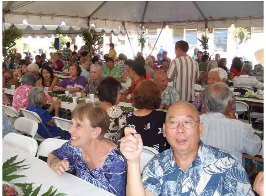
Under the big tent, people enjoyed Hawaiian music and food, and most of all, fellowship.