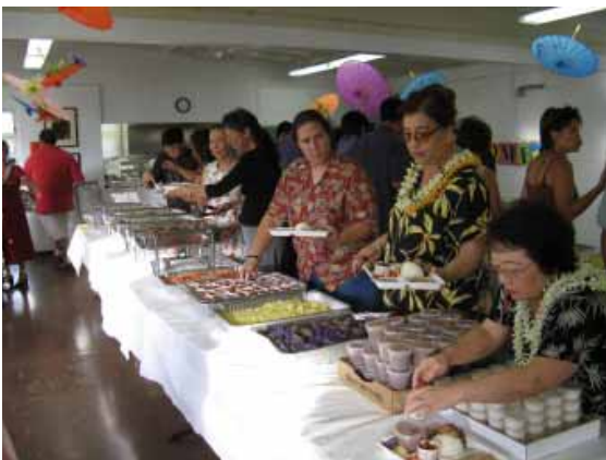
Lots of yummy Hawaiian food for the large crowd.

more pictures can be found on the website: stelizabeth720.org