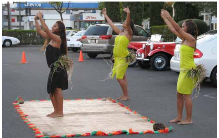
Members of the Polynesian Club of Castle High School do a Tahitian dance.