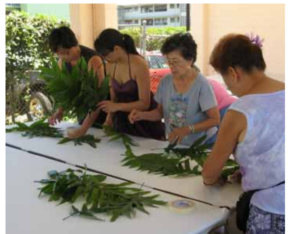
Getting ready for the big luau on August 29th.