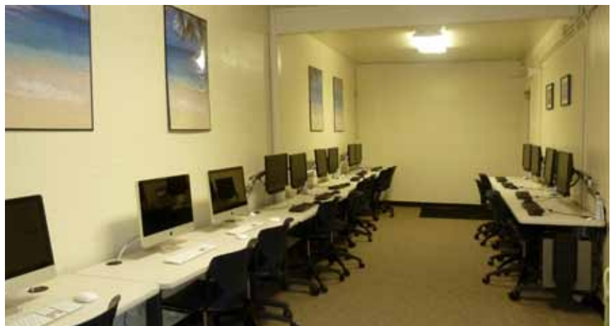
The Mauka computer lab.