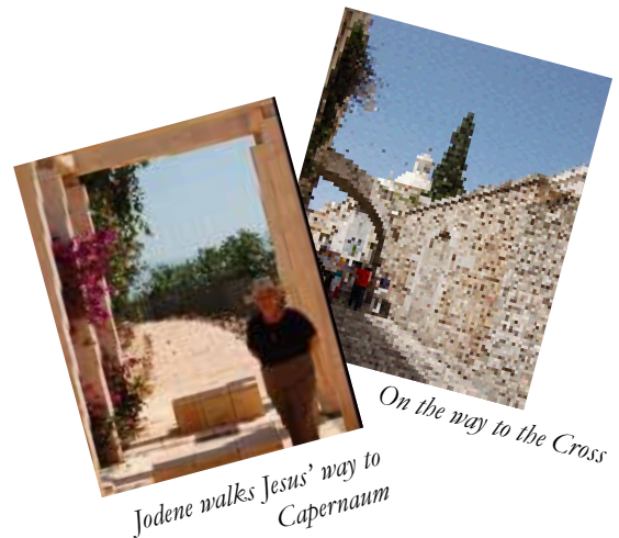
Jodene walks Jesus' way to Capernaum

Land package price will be approximately $2300 per person double occupancy. Israel transfers and transportation, hotel and guest house accommodations in double or private rooms (Single occupancy add $385), all meals, entrance fees, guiding fees, portage, daily gratuities. it does not include airport transfers to and from Jerusalem unless meeting the group at Tel Aviv airport. Jodene can assist for mainland connections