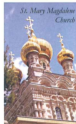
St. Mary Magdalene Church