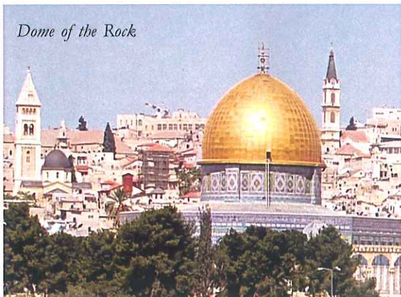
Dome of the Rock

Our Women's Pilgrimage is an opportunity to weave the golden strands of the threads of our lives into sacred story and through the sacred vortexes of divine energy in the Land of Jesus and Holy Women. The 'Thin Places' of the Holy Land are our destinations: Jerusalem, Bethlehem, Jericho, Nazareth, Sea of Galilee, the Jordan River, Garden of Gethsemane, Way of the Cross, The Empty Tomb, The Dome of the Rock, The Western/Wailing Wall, the Healing Pools of Bethesda, Bethany, Capernaum and Jacob's well where the Samaritan woman received life-changing water. through ancient texts, imagery and contemporary writings. Many of the women appearing only at the edges of history, the unnamed women whom Jesus honored, respected and included in his work and his vision will come to light along our way: Mary, Elizabeth, Mary and Martha, Ruth, Naomi, Mary Magdalene, the Woman at the Well, Anna, Hanna and Joanna, Anne, Deborah, Jael, and the women at the Empty Tomb—women healed, women transformed, and women who 'saved the day.' We will meet them in story, song, and visions for the world God so loved. We will see our world with new eyes and new perspectives. We also have the privilege of meeting the women and men who today are the living stones of the land of Jesus, keeping the faith despite overwhelming challenges. We will feast