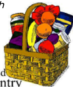
Food Pantry Ministry

Your generosity is greatly appreciated in donating the following items needed for our food pantry: Spam, Vienna sausage, canned pork and beans, tuna, ramen, corned beef hash and rice. We are also grateful for your donations to this cause. It costs over $100 per week in food to stock our pantry. Please help those n need by making checks payable to St. Elizabeth's Pastoral Fund.