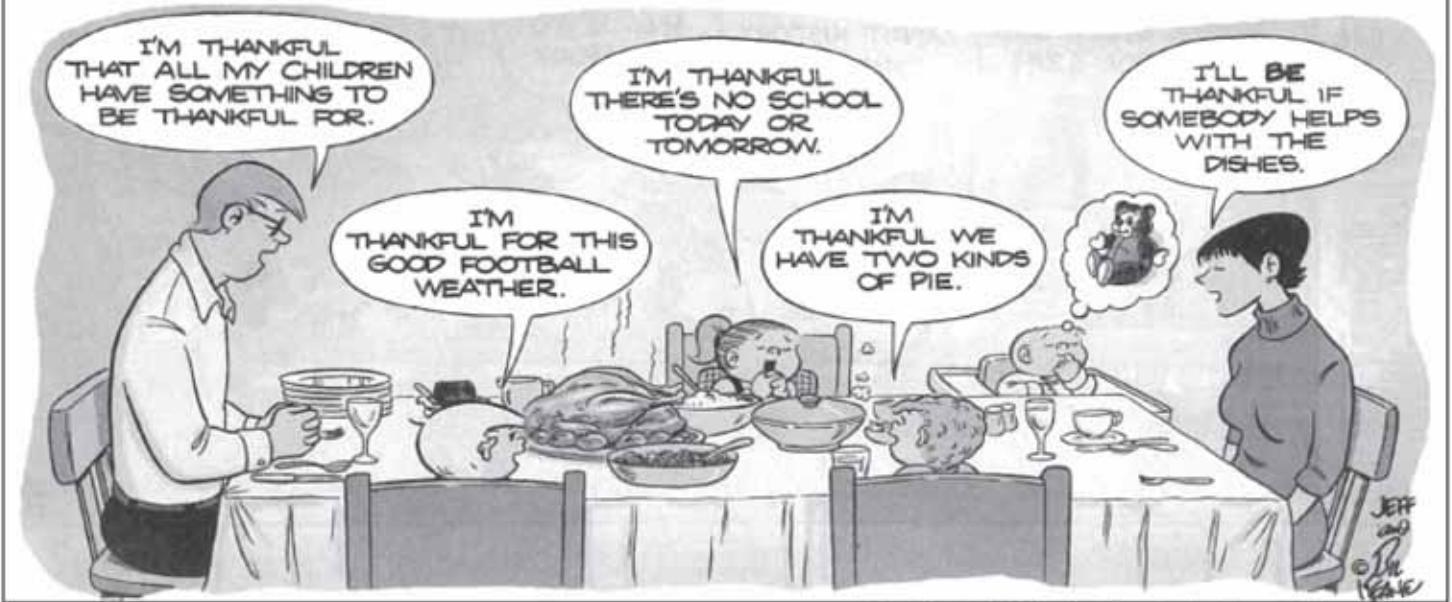
from The Joyful Noiseletter Reprinted with permission of Bil Keane