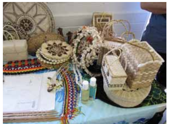
The intricate hand woven crafts are stunning in their detail and artistry.