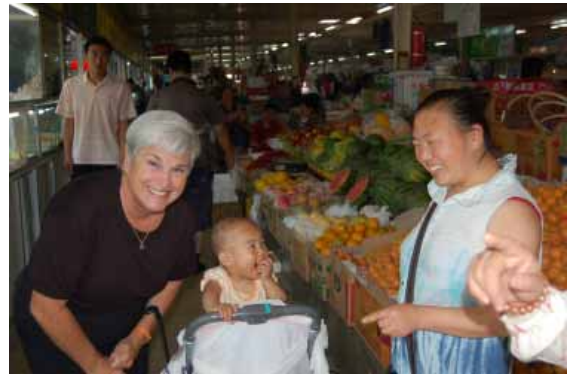
New friends in local Beijing market.