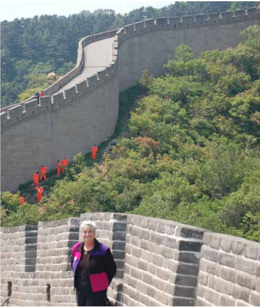
Climbing the Great Wall.