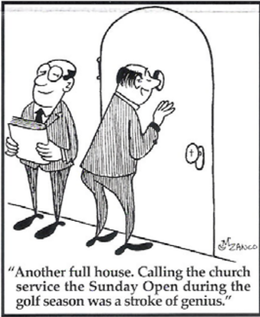
from JoyfulNoiseletter.com