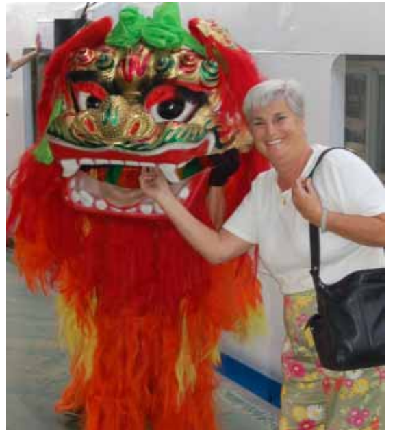
Welcome to Yangtze River boat tour.