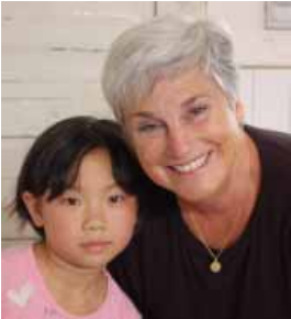
Village school girl.