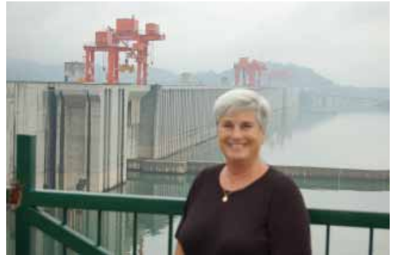
Yangtze: The Three Gorges Dam.