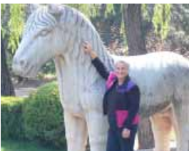
Valley of the Ming tombs.