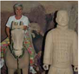
X'ian Terra cotta warriors.