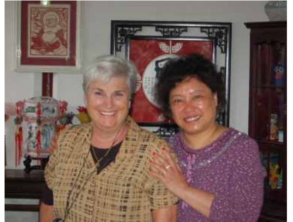
Home visit in the Hutongs of Beijing.