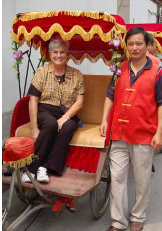
Rickshaw ride through the Beijing Hutongs.