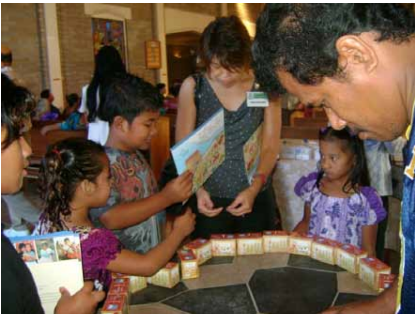
Children are gathered around the arks which collected loose change for Heifer International. This year's donations will go to benefit the people of Haiti.