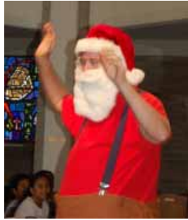
Neighborhood Christmas party.