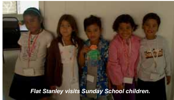
Flat Stanley visits Sunday School children.