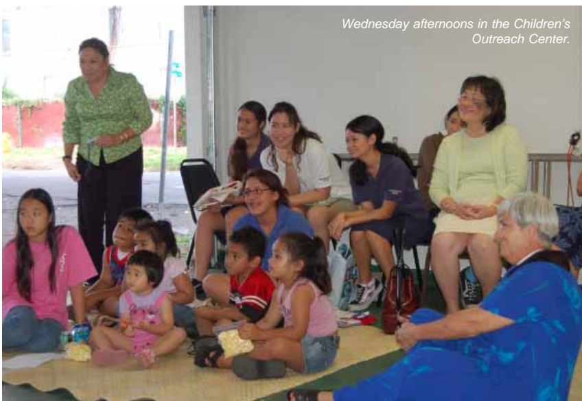
Wednesday afternoons in the Children's Outreach Center.