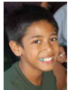
Children from the Outreach Center.