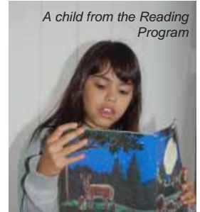
A child from the Reading Program