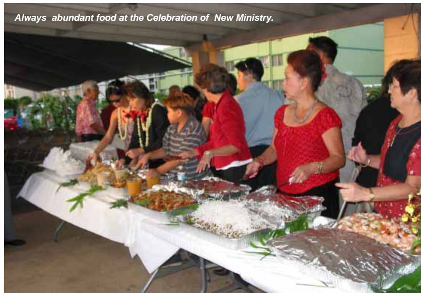
Always abundant food at the Celebration of New Ministry.