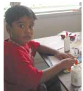
Sunday School children.