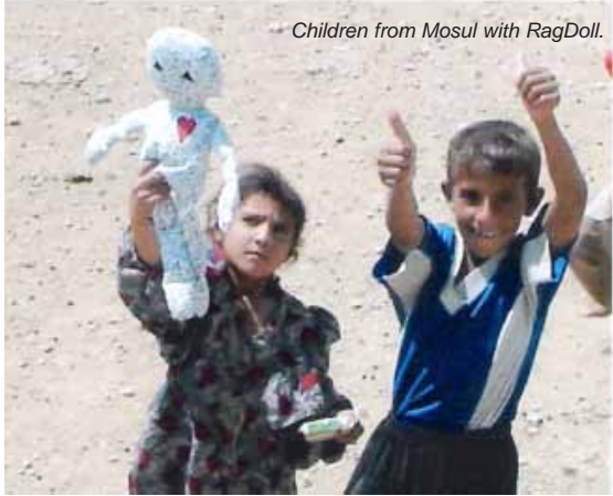
Children from Mosul with RagDoll.