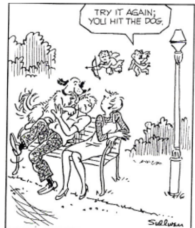
from The Joyful Noiseletter