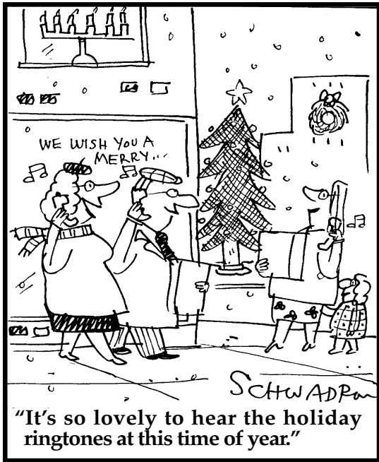
from JoyfulNoiseletter.com