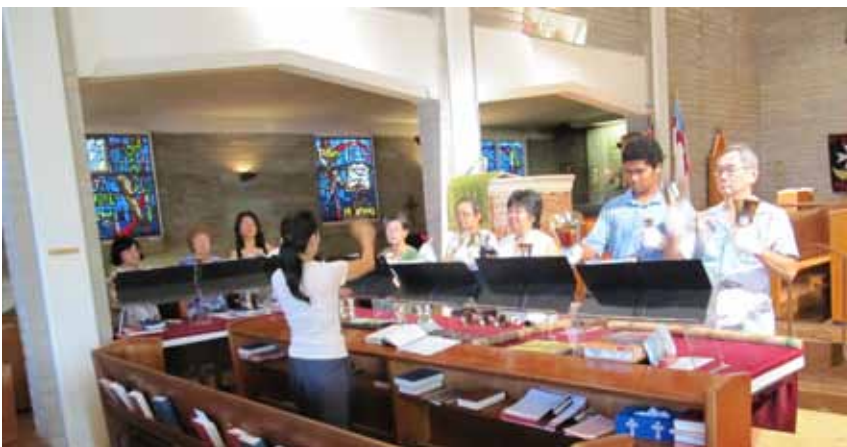
St. Elizabeth's Handbell Choir rehearses in preparation for the upcoming holiday services.

God's blessings on those with December birthdays!